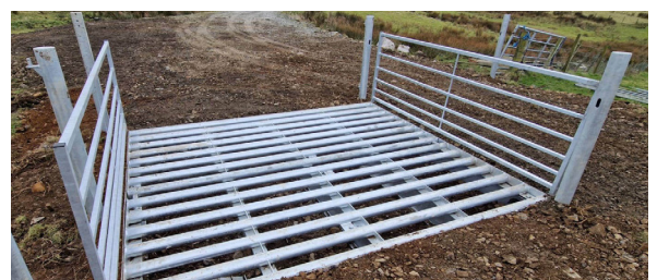
Round Tube Top Grid Option ▲